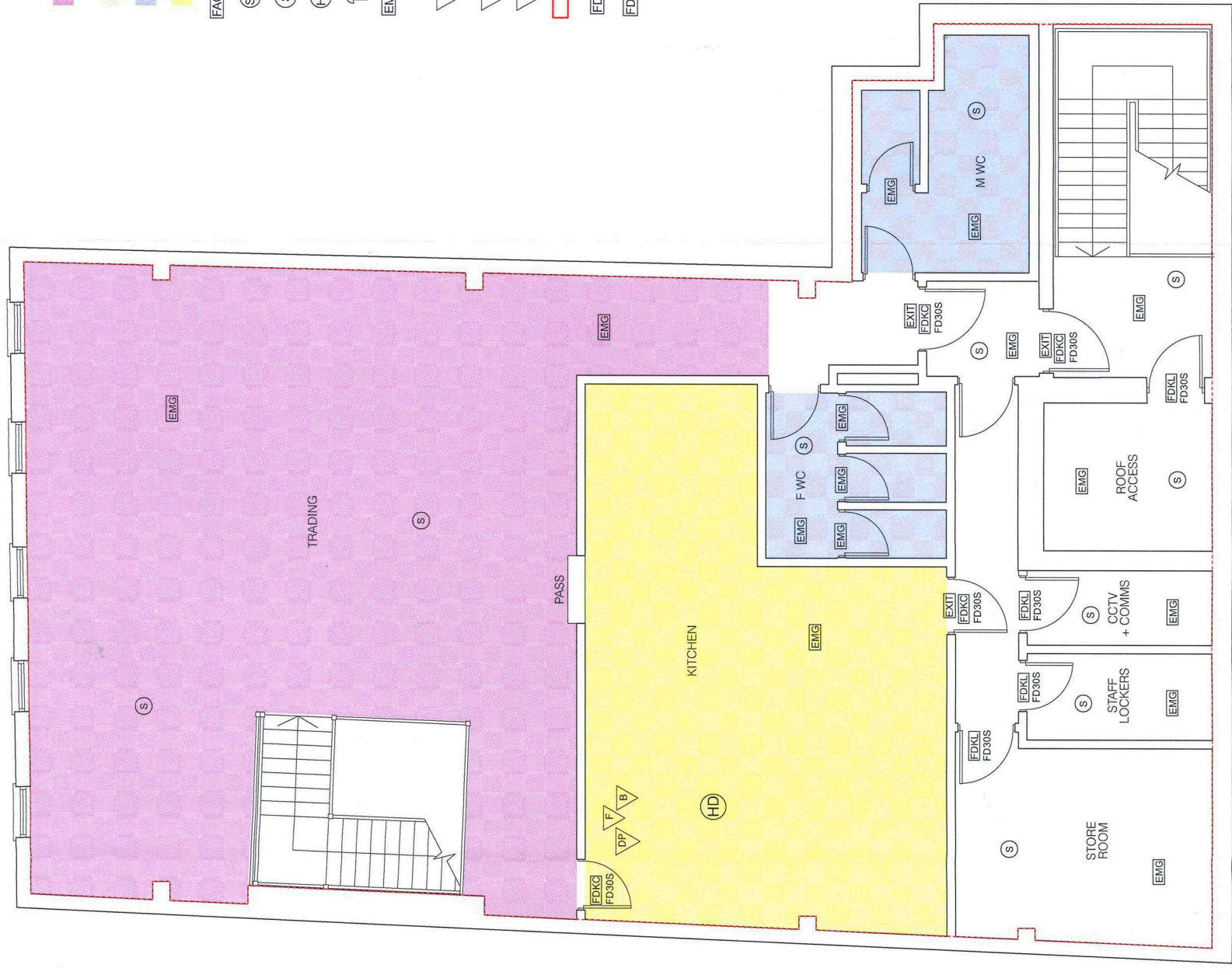
FIRST FLOOR PLAN - 1:50@A1, 1:100@A3